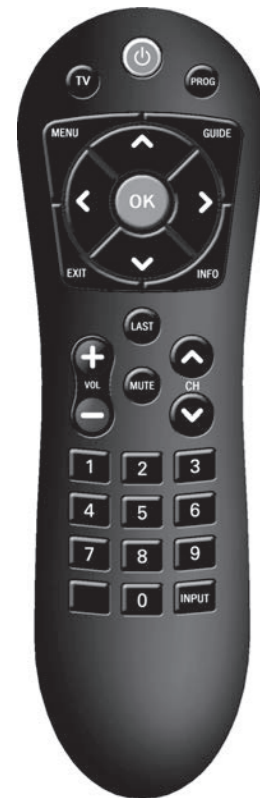
OCE-0189B REV 02 (05/23/18)